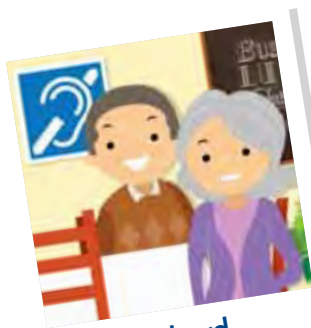
Deaf or hard of hearing