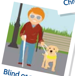
Blind or partially sighted